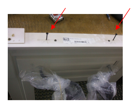
Cabinet without crown molding