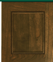
Cherry Dark Wood Code: C Color Code: D-