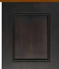
Maple Espresso Wood Code: M Color Code: E-