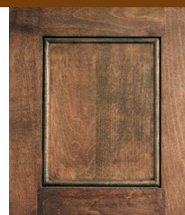
Maple Sable Wood Code: M Color Code: S-