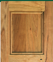
Cherry Natural Wood Code: C Color Code: N-