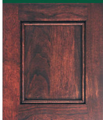
Cherry Auburn Wood Code: C Color Code: A-