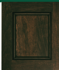
Cherry Sable with Black Glaze Wood Code: C Color Code: SB