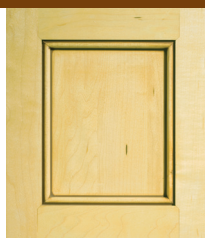
Maple Natural with Chocolate Glaze Wood Code: M Color Code: NC