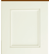
Maple White Painted Wood Code: M Color Code: X-