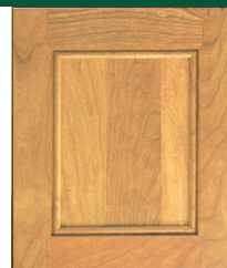
Cherry Golden Wood Code: C Color Code: G-