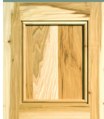
Hickory Natural Wood Code: H Color Code: N-