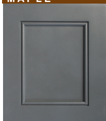
Maple Charcoal Painted Wood Code: M Color Code: C-