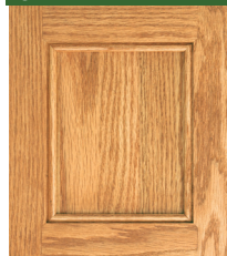
Oak Golden Wood Code: O Color Code: G-