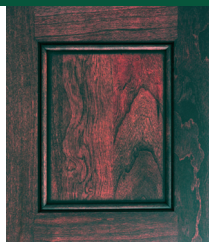
Cherry Auburn with Black Glaze Wood Code: C Color Code: AB