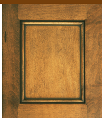
Maple Medium with Mocha Glaze Wood Code: M Color Code: MM