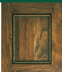
Cherry Medium with Mocha Glaze Wood Code: C Color Code: MM