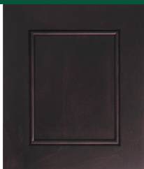
Cherry Burgundy Wood Code: C Color Code: B-