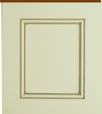
Maple Biscuit Painted with Pewter Glaze Wood Code: M Color Code: ZP