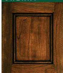
Cherry Medium with Black Glaze Wood Code: C Color Code: MB