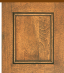
Maple Medium with Chocolate Glaze Wood Code: M Color Code: MC