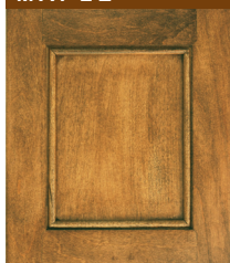
Maple Medium Wood Code: M Color Code: M-