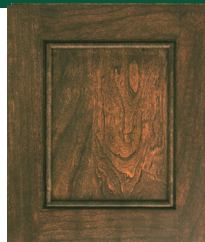
Cherry Sable Wood Code: C Color Code: S-