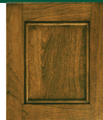
Cherry Medium Wood Code: C Color Code: M-