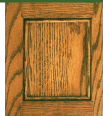
Oak Medium Wood Code: O Color Code: M-