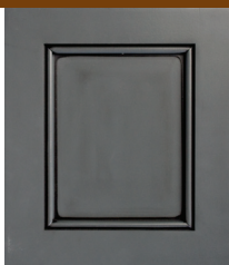
Maple Charcoal with Black Glaze Wood Code: M Color Code: CB