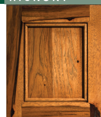
Hickory Medium Wood Code: H Color Code: M-