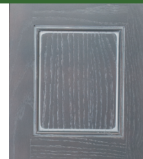
Oak Quarry Gray with White Glaze Wood Code: O Color Code: QW