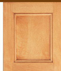
Maple Golden Wood Code: M Color Code: G-