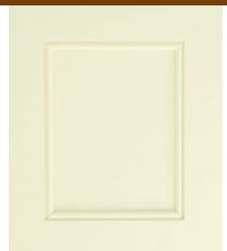
Maple Biscuit Painted Wood Code: M Color Code: Z-