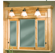
Door hinge side change