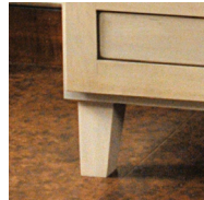
5" Square Tapered Legs