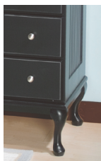
Queen Anne Leg (Optional only)