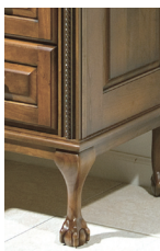
Ball & Claw Leg (Optional only)