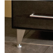
5" Metal Legs