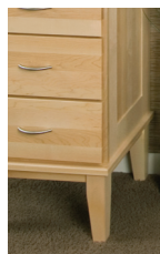
Square Tapered Leg (Standard)