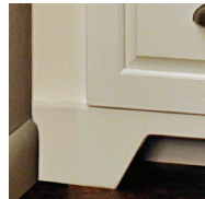
3" side stile extension