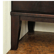
Dresser vanity next to wall